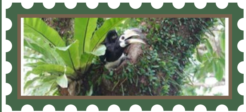
Winner of the 'Best-photographed Observation' award by Yumin Primary.

On 1 June 2022, the Nature Society of Singapore organised their inaugural Biodiversity Race 2022 as part of their Every Singaporean A Naturalist (ESN) programme. Our Environmental Club members participated in this programme, through which they had the opportunity to discover the many fauna species in Singapore that could be found at Pasir Ris Park.